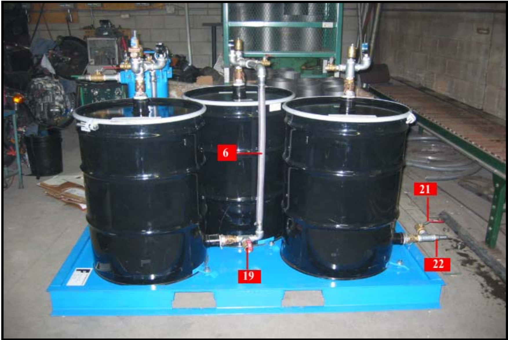
Photograph 3 – 5 GPM Pump & Treat System (Third View)